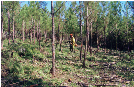
Silvicultural treatments: clearing, thinning, and pruning.