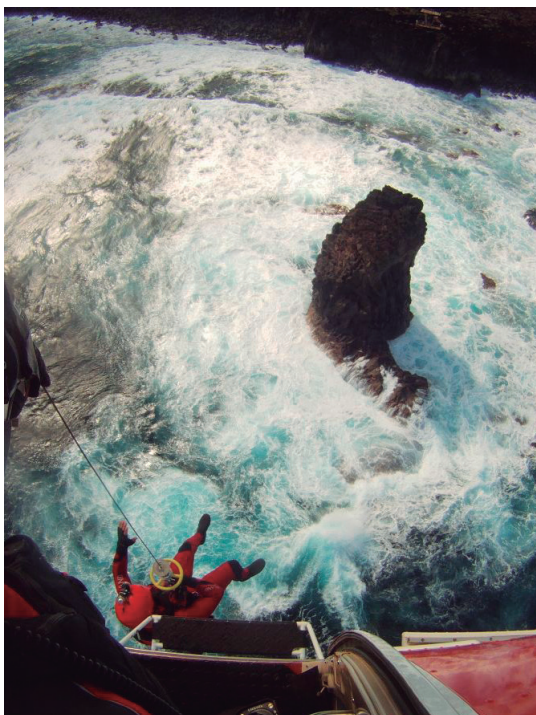
Management of aerial search and rescue (SAR) services onshore and offshore.