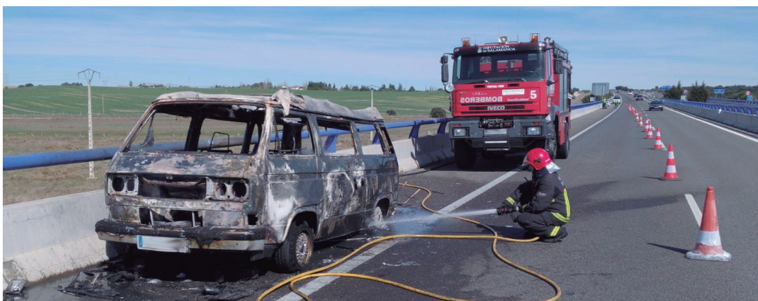
Indirect management of fire stations.