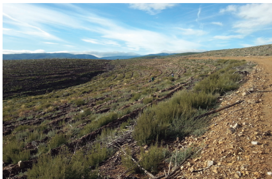
Reforestations and plantations.