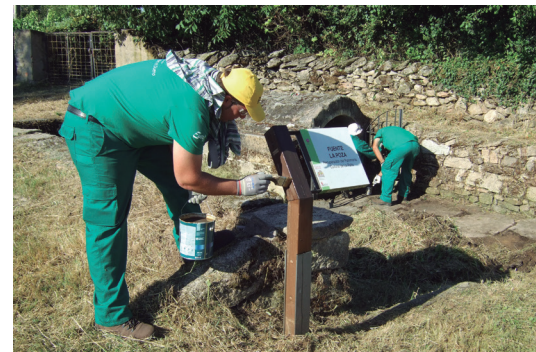
Maintenance of natural spaces.