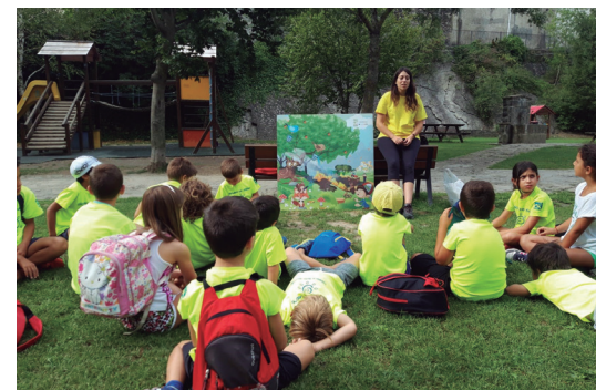
Design, management, and execution of fire awareness campaigns.