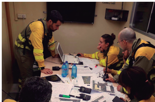
Planning and technical advisory in forest fire extinction. Support for the Incident Management Team (IMT).