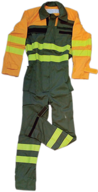
FW-10 GREEN COVERALL