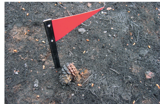
Investigation of causes of forest fires (BIIF - Fire Cause Investigation).