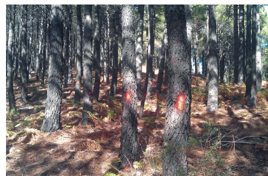
Forest management, forestry projects.