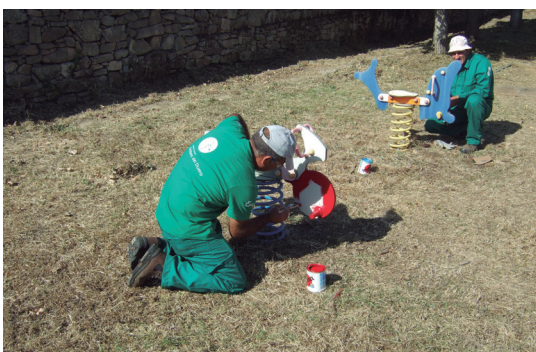
Parks and gardens.