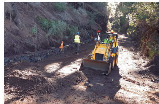
Rural engineering and construction.