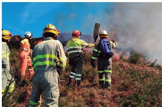
Planning, execution, and supervision of controlled burns.