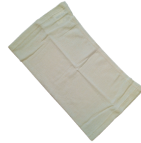
NECK PROTECTOR V3-005