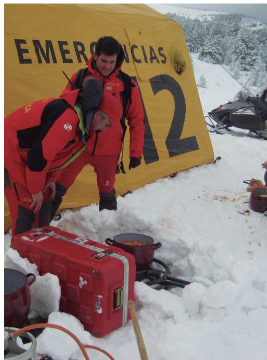
Logistical support units in emergencies.