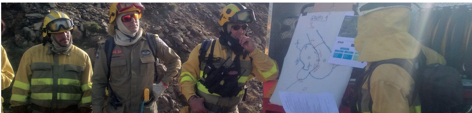
Technical consultancy, fire analysis.