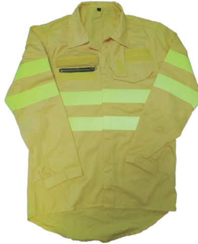
FW-20 GREEN SHIRT