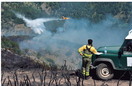
Coordination of aerial resources, surveillance, and deterrent activities.