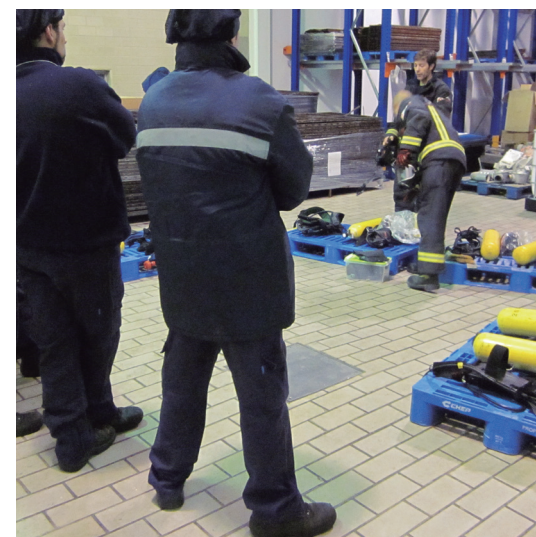
Specialized training for civil protection and emergencies.