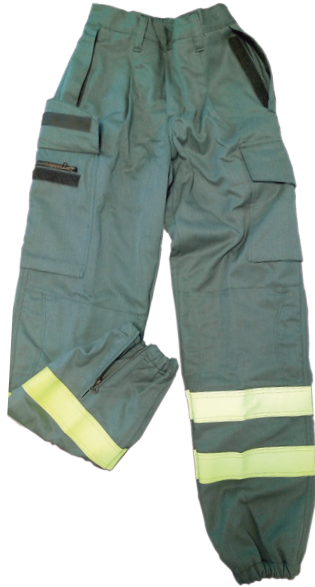
FW-30 GREEN PANTS