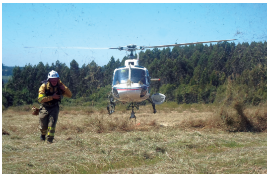
Management of ground and helicopter-borne crews.