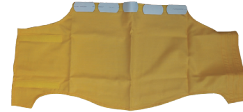
FW-40 NECK GAITER