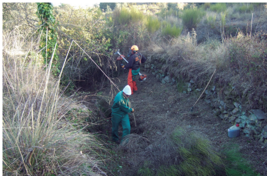
Watercourses and riverbanks.